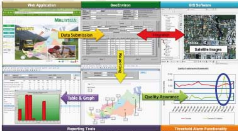
GeoEnviron Integrated Systems Management Capability