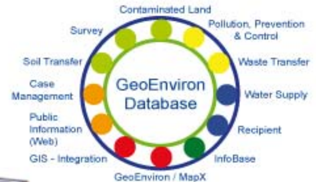
GeoEnviron / MapX GeoEnviron Modular Framework